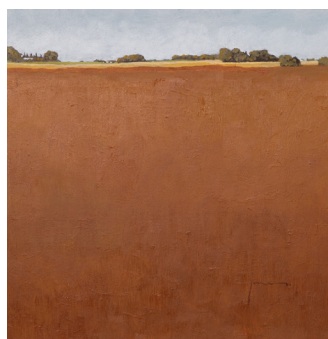
September, 2018 Oil on canvas 24 x 24 inches $2,000.00