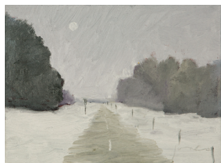
County Road Winter, 2018 Oil on panel 9 x 12 inches $950.00