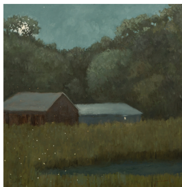
Nocturne Fireflies, 2018 Oil on canvas 30 x 30 inches $2,800.00