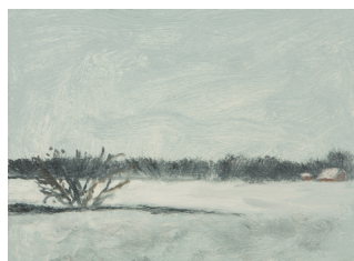
Near Crowe Farm, 2018 Oil on panel 9 x 12 inches $950.00