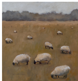
Grazing, 2018 Oil on canvas 12 x 12 inches $1,000.00