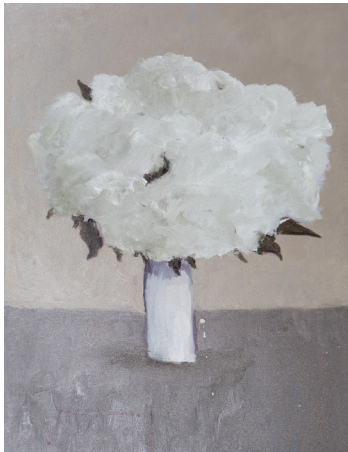
Still Life in Grey, 2018