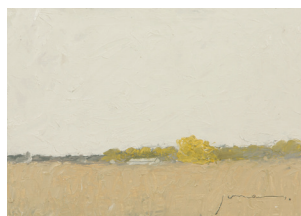
August, 2018 Oil on panel 8 x 10 inches $850.00