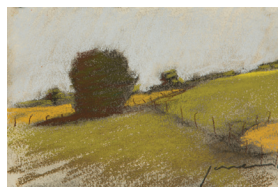
Fencelines, 2018 Pastel on paper 6 x 9 inches $750.00