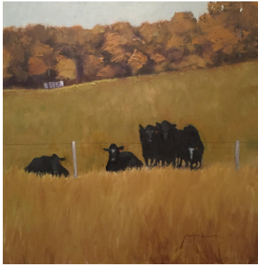
The Beekeeper's Angus, 2018