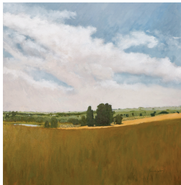
Becker County Overlook, 2018 Oil on canvas 30 x 30 inches $2,800.00