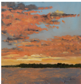
Sunset on Pelican Lake, 2018