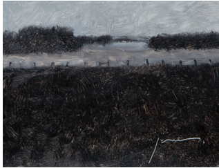
Property Line VII, 2018