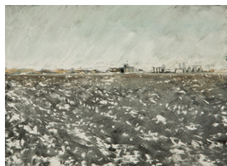
First Snow Near Comstock, 2018 Pastel on sandpaper 9 x 11 inches $950.00