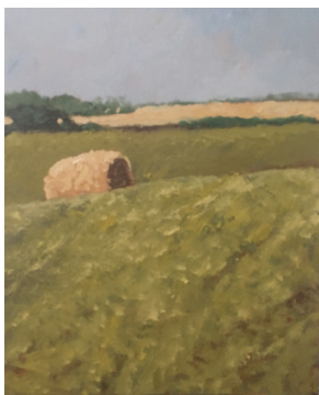
View with Bale, 2018